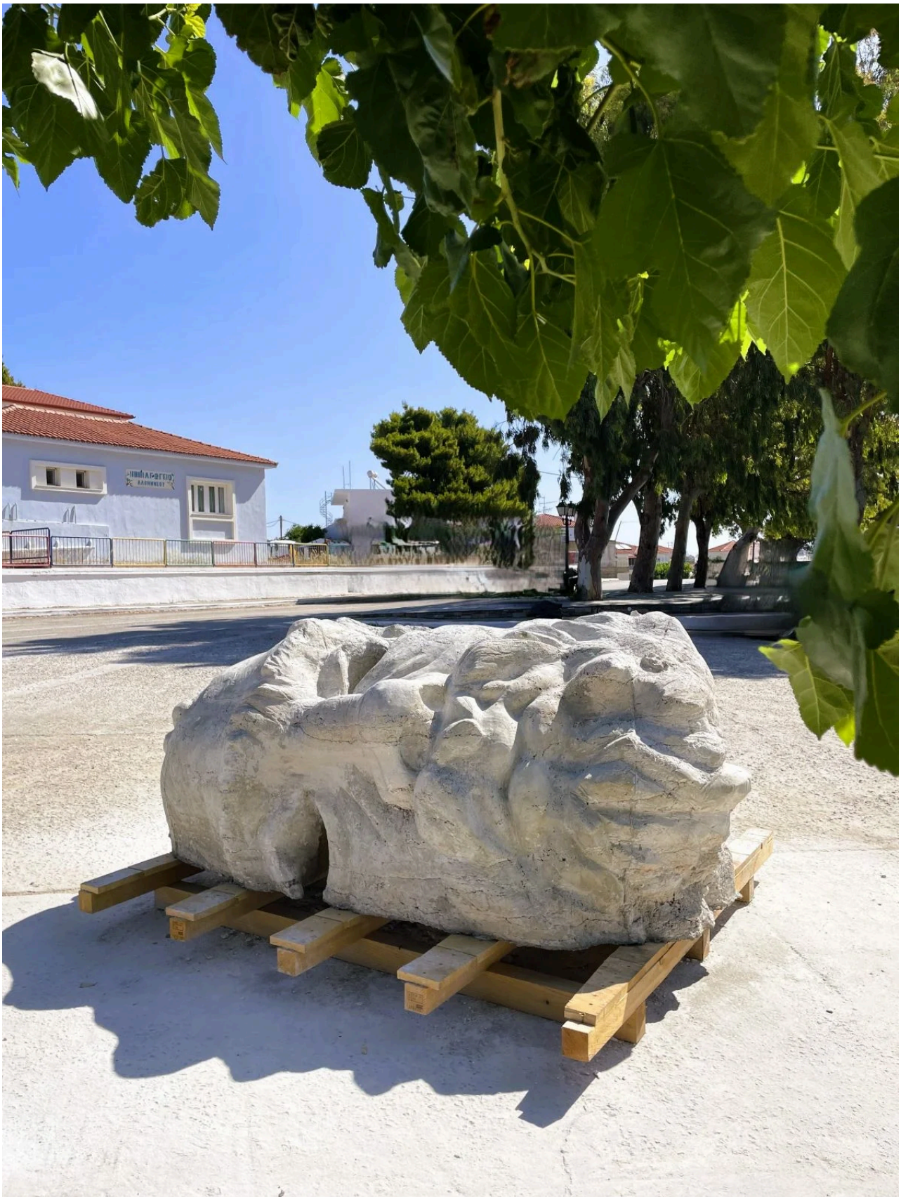
Aetas by Micol Cornali

All websites across the EU are now required to ask your permission to place cookies on your machine. We use cookies to enhance your navigation, analyze site usage, and assist in our marketing efforts. (See our Privacy Policy for more details.) About ART4SEA Scubaverse Ltd. and its partners use cookies to improve your experience. This includes personalizing content and advertising. To learn more, click here. By continuing to use our site, you accept our use of cookies, revised Privacy Policy and Terms and Conditions.